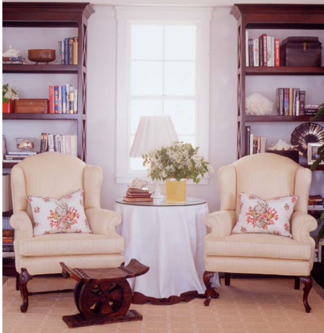
This page: The dining room table is made out of an Indonesian rain barrel, with an ebony-stained palmwood top. Garage-sale chairs get a new lease on life with bright coral paint and zebra-striped cushions. Opposite top: Designer Debbie Fogel helped with the living room, finding the Rose Tarlow herringbone silk for the wing chairs and designing the bookcases. The pillow fabric is by Scalamandr ; barrel stool is Balinese. Opposite below: In the family room, washable slipcovers are Waverly ticking. The children can make any mess they like on the turquoise-painted picnic table, available from S.E.A. Design & Co.